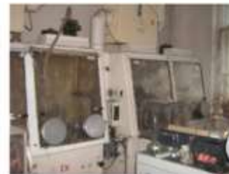
Lab for decommissioning